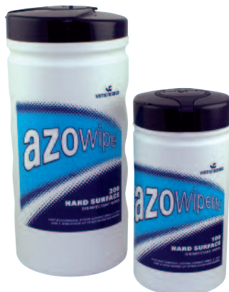
AZOWIPE 200 WIPES