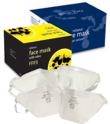
FFP2 BOX OF 20