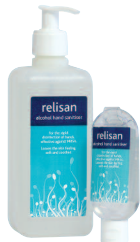
RELISAN 50ML WITH CLIP