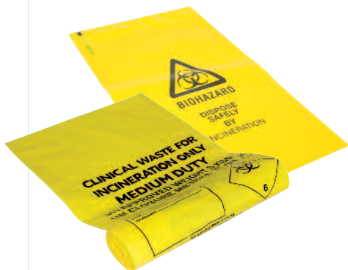
SELF SEAL CLINICAL WASTE SACKS 20cm x 30.5cm Pk 50