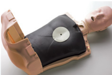
Audible clicker mechanism increases student's confidence in administering adequate compressions.