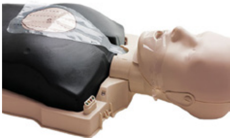
Easy to insert, non-slip face shield and lung bag speeds setup of the manikin.

'Helping students to experience CPR learning realistically'